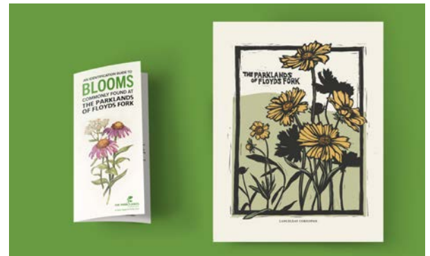
FLOWER GUIDE PARKLANDS PARTNER+