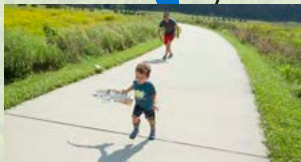
During the COVID-19 pandemic, The Parklands provided a safe space for the community to enjoy, reaching a record breaking 3.8 million visits in a single year in 2020.