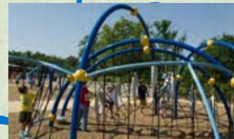
2021 marks the 10th year of The Parklands providing world-class parks, 365 days a year to residents of Louisville and the greater region.