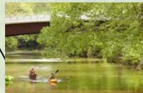
The Parklands of Floyds Fork is named one of Louisville's Top Tourist Attractions by Louisville Business First.