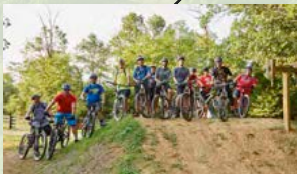
Silo Center Bike Park in Turkey Run Park opened to the public in 2017.