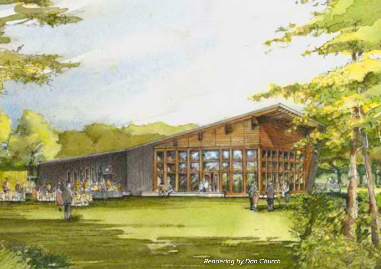
Rendering by Dan Church