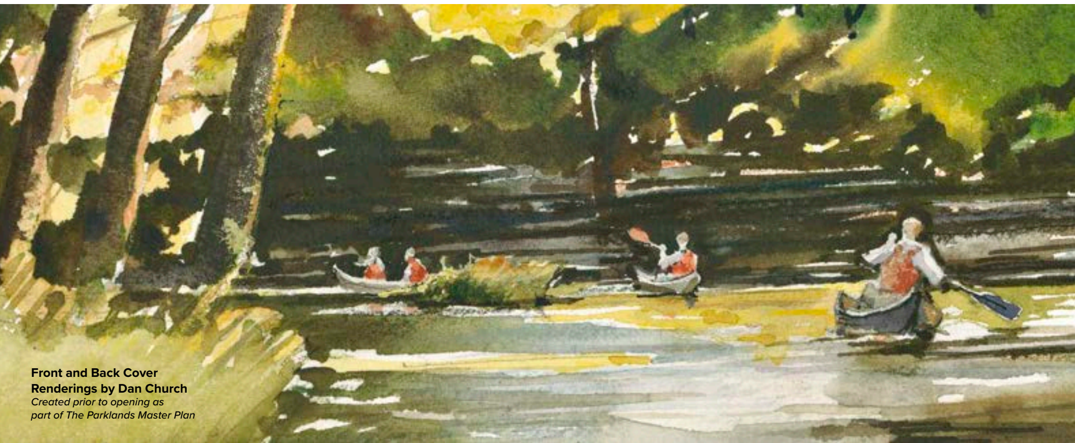
Front and Back Cover Renderings by Dan Church Created prior to opening as part of The Parklands Master Plan

Your continued support will positively shape the future of Louisville and truly benefit current and future generations through access to world-class parks. Donate today at theparklands.org/donate .