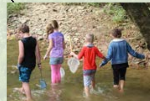
The Parklands launched the Forest Learning Lab and a number of virtual programs to continue providing educational opportunities during the COVID-19 pandemic.