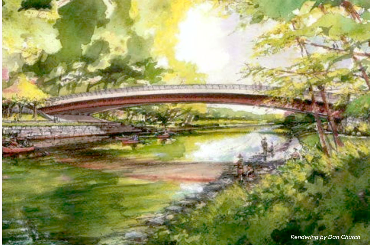
Rendering by Dan Church

RENDERINGS CREATED PRIOR TO OPENING, COMPARED TO THE SAME AREAS TODAY