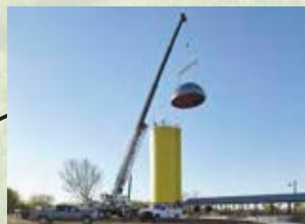
Construction on The Strand, Turkey Run, and Broad Run Parks began in July of 2013.