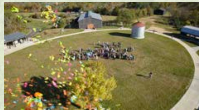
Turkey Run Park opened in October 2015.