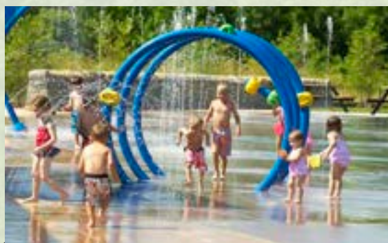
The Marshall Playground and Sprayground in Beckley Creek Park opened in June 2011.