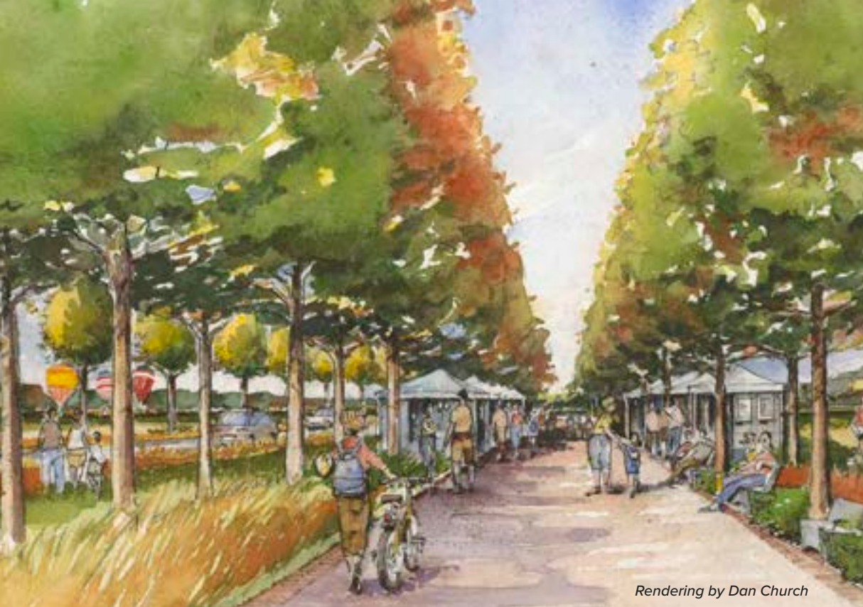
Rendering by Dan Church