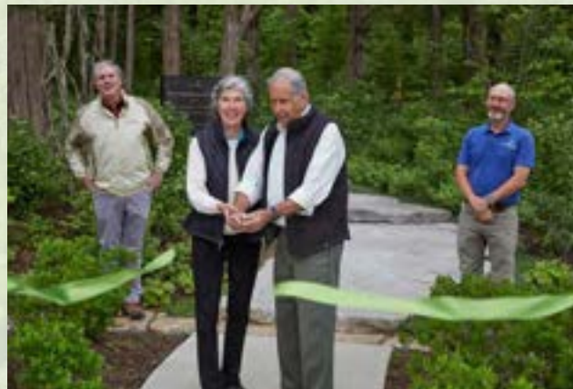
Moss Gibbs Woodland Garden opened in 2019.