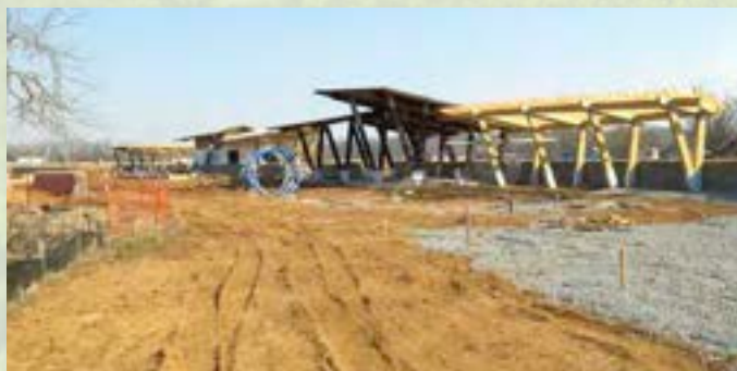
Construction of Creekside Center in Beckley Creek Park, 2011