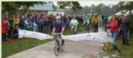
The Strand opened in September 2016, connecting all four parks via The Parklands section of the Louisville Loop.