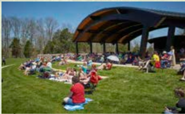
Broad Run Park opened to the public in 2016.