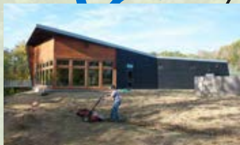
Gheens Foundation Lodge Construction, Beckley Creek Park, 2012