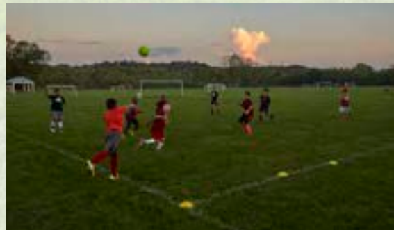
Pope Lick Park opened in September 2013.