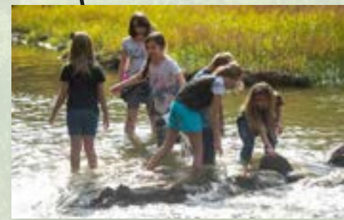
The Parklands reached 1 million visits in a single year for the first time in 2014.