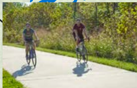
The first portion of the Louisville Loop within The Parklands opened in November 2012.