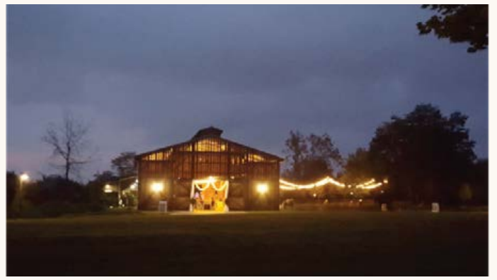
BARN AT NIGHT