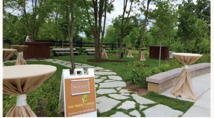
COCKTAIL HOUR ON BARN EVENT LAWN