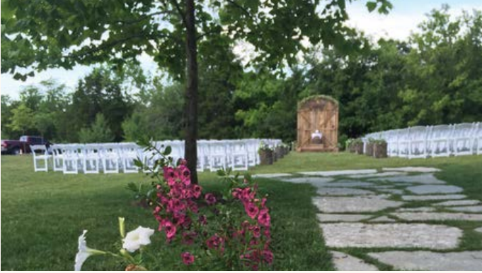
CEREMONY ON BARN EVENT LAWN