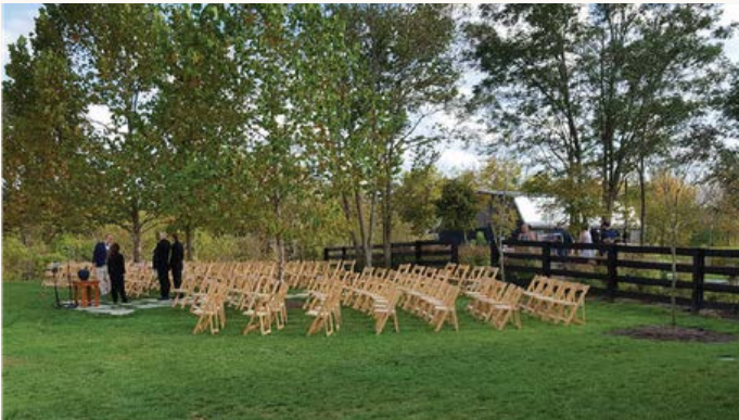
CEREMONY ON BARN EVENT LAWN