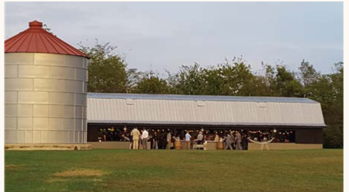
ADD-ON: EXPAND EVENT TO PIGNIC BARN!